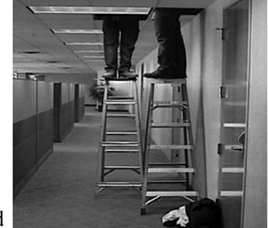
Top or top step of stepladder must not be used as a step.